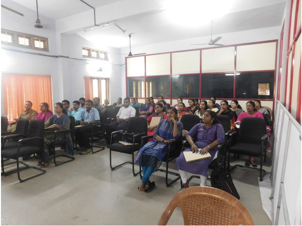
External Counselling Mentoring 2019-2020