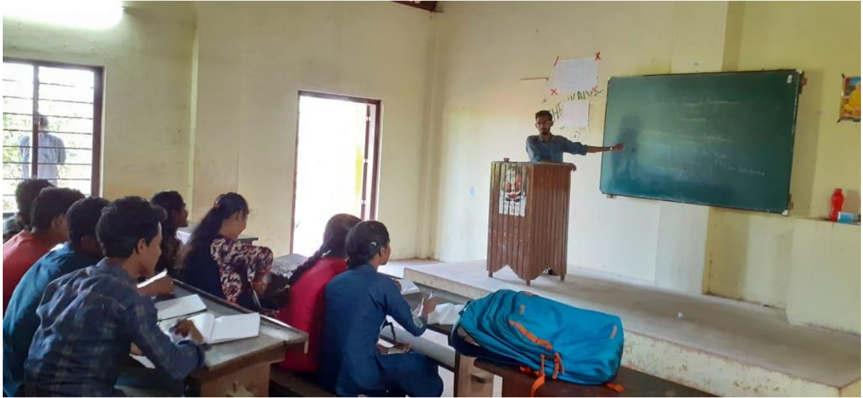
Internal Mentoring 2019-2020