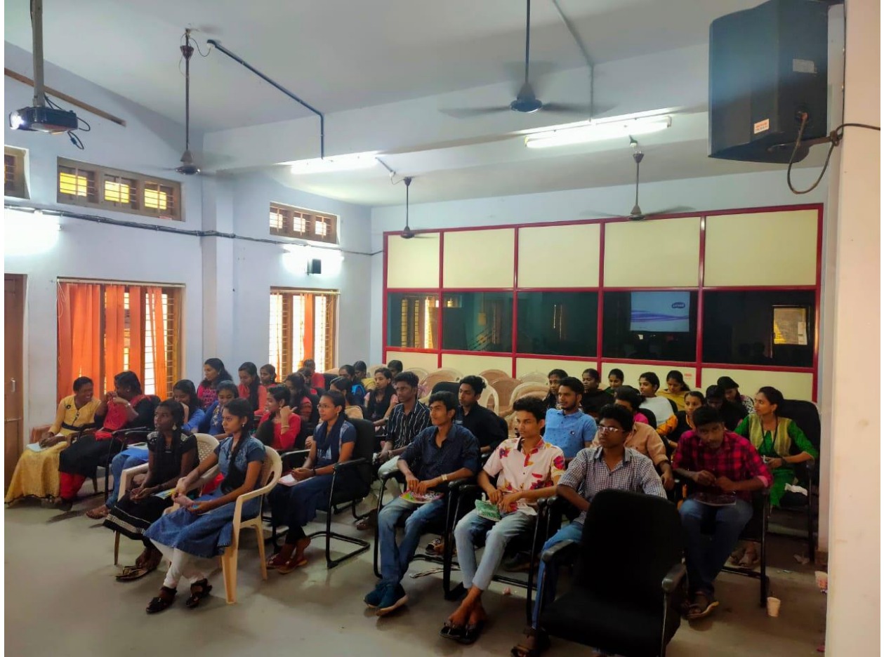
Interactive session 2019-2020